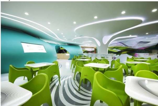
Figure 5. Lotte Department Store in Seoul, South Korea by Kareem Rasheed

The type of ceiling is not the only influencing factor – the height of the ceiling and design plays a role as well. Drop ceilings, also known as suspended ceilings, are found in many homes today, and they are installed in almost all basements and other rooms. They have two parts - the first is the suspended metal grid to which the second, the acoustic panels, are attached to. These panels are inserted into the metal grid. Decorative options are available such as metal panels or coffered panels. Such a design is relatively flat, without any angles or geometric features beyond the natural shape of the room. Ceiling tiles can be smooth or textured, capitalizing upon antique tin designs that complement traditional and contemporary spaces. Such tiles attach directly to an existing ceiling, which means they work well with any geometric space and can increase the volume in a room (Mitton & Nystuen, 2007, p. 22).