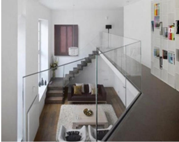
Figure 3 Spacious Double Height Apartment Designed by Squire and Partners Architects.

utilize the available volume and create a sense of spaciousness. As Bernard Hoesil describes: “The connection between the space of two separate levels through a common expanse of air has the