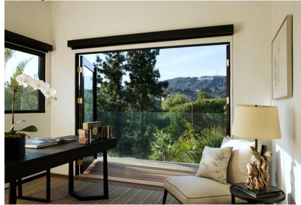
Figure 1 Large window

designers use. They spend a lot of effort to determine the size and location of windows and artificial light sources. The amount of sunlight that penetrates a room influences its perceived size. Windows that are set low enough to capture the full extent of the sun and natural lighting visually increase the space in any room. (Pile, 2009, p. 36)