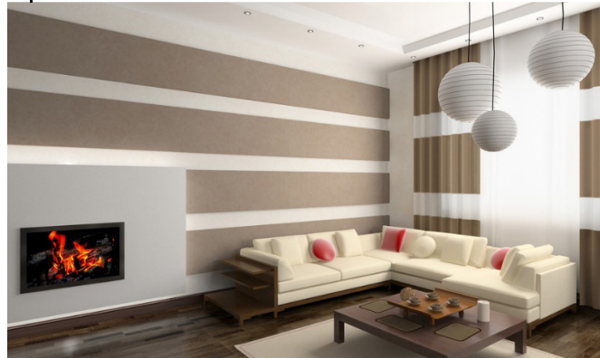
Figure 7. The use of Horizontal Lines in Interior spaces

grounding, stability, direction and emphasis. Such lines tend to lower the ceiling and create a length of space. The horizontal lines can be used to direct the viewer to the specific focal point. The lines also suggest a harmonious, solid relationship with the earth, which offers the viewer a sense of tranquility. They can expand the room visually making it appear wider and longer (Jaglarz, 2011, p. 364). An interior space painted with horizontal stripes tend to move the eye horizontally, which emphasize the width of the room (Hepler, Wallach, & Hepler, 2013, p. 22). A single horizontal line running from one side of the wall to the side increases the width of the wall as it makes the eyes move to the 'nothingness' at the end of the line. However, a single horizontal line on all walls of a room makes the room appear constricted as the eyes are confined to these lines. A line high on the wall, with the same color as the ceiling enlarges the ceiling - making the room appear visually larger. The walls may appear shorter making the room appear smaller. This happens if the line is in the middle of the wall and has high contrast color. A series of horizontal lines of the same color and width on entire walls makes the room appear visually higher. Similar color lines that has a high contrast color provide the same expanding effect (Erlam, 2016).