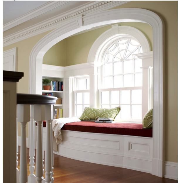
Figure 2. Bay window or centralized nook

as though there is twice the available space in a single room.