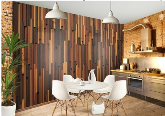
Figure 6. The use of vertical Lines in Interior spaces

Unlike vertical lines that narrow the room making it appear higher, horizontal lines widen the room; making it appear lower. Just like vertical lines, the horizontal lines or stripes evoke the feeling of